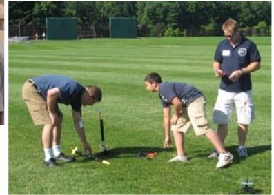
ABOVE & RIGHT: STEPS participants building rockets, adding parachutes, and launching them during the 2009 Academy.