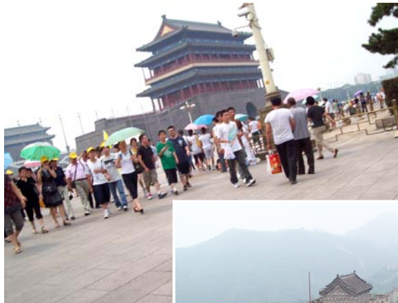
Pictures of Rochester City School District students, their adult counselors, Chinese acquaintances, and scenery were provided by participating students.

As follow-up to their summer experience, China Scholars study Chinese language and culture throughout the school year back home.