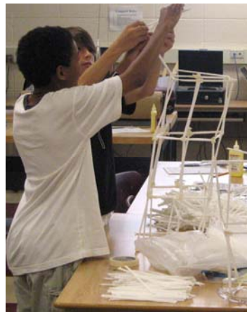
LEFT & BELOW: STEPS participants competing to see who could construct the tallest stable tower.