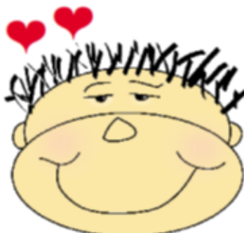
Loved Amado / querido