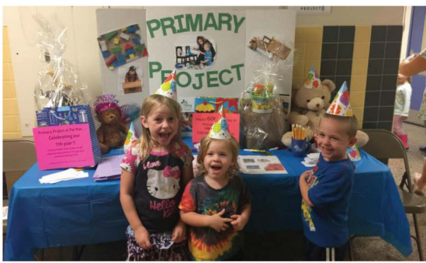
Palmyra Macedon Primary School