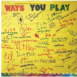
RCSD School #33

We love hearing from you – please send us pictures of your school activities!