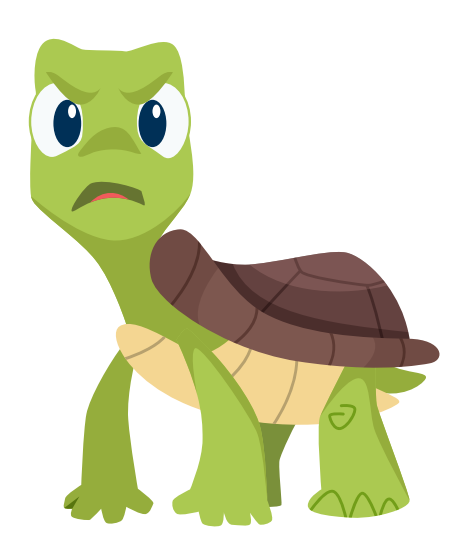
Step 1. Recognize your feelings.