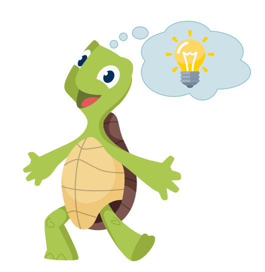
Step 4. Come out when you are calm and think of a solution.