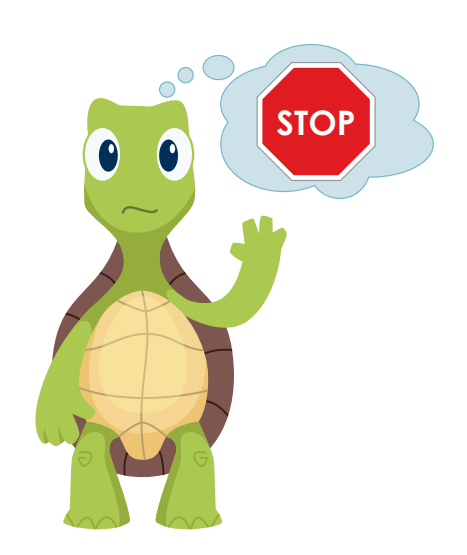
Step 2. Stop your body.